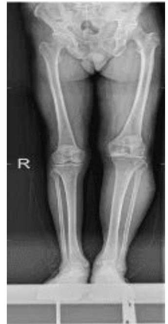
Figure 2: Preoperative X-ray showed severe degenerative osteoarthritis of the left knee, with hypertrophic and square femoral condyle and subchondral bone sclerosis

The operation was performed under combined spinal anaesthesia.