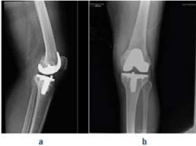
Figure 3: One year later, X-ray showed that the prosthesis was in good position

A year later, the patient reports a significant reduction in knee pain during follow up examination. In addition, the patient was able to walk normally and had found a job. Furthermore, the patient was able to travel by congested bus without external support. The patient expressed satisfaction with the postoperative outcomes (Figure 3).